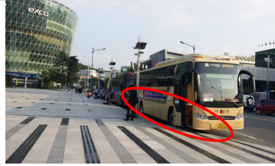
EXCO (Gate 3)

IF YOU NEED ASSISTANCE AFTER TAKING TAXI, CALL TCI 2015 SECRETARIAT, +82-53-746-9963