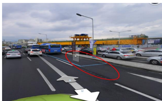
Dongdaegu Station (Bus stop for city tour)