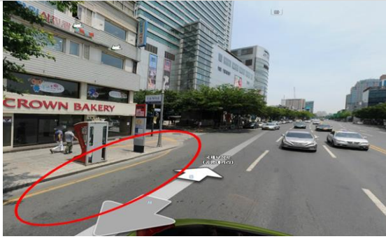
Novotel (In front of Novotel, Bus stop for city tour)